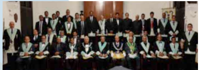
Serendib Lodge No. 905 Installation Banquet 2019