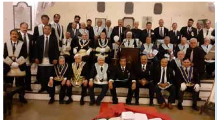
The Right Worshipful Provincial Grand Master with the Brethren at the Centenary Celebrations of Lodge Hely Hutchinson No. 465, Pune

The Centenary meeting and Celebrations started in September and it was a roller-coaster ride for the next two months. Lodge No. 464 Minden, located at Kollam in the southern State of Kerala, which is