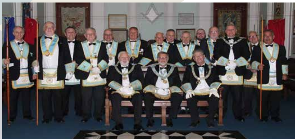
Installation at Donegal Lodge No. 873 on 31st August 2019.

Our own IMBF (Irish Masonic Benevolent Fund) continues to grow from strength to strength with