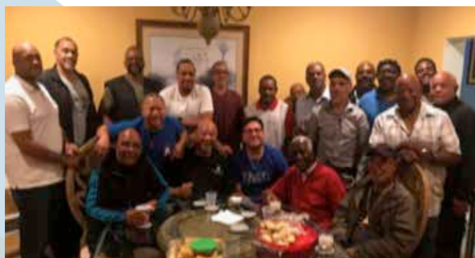
Brethren gathering at the Provincial Grand Master's residence after a long day of Christmas visitations to widows and ill Brethren.

DC in attendance, along with the past Grand Master of Boston and brethren from North Carolina. The speaker for the evening was the Premier of Bermuda, the Hon. David Burt.