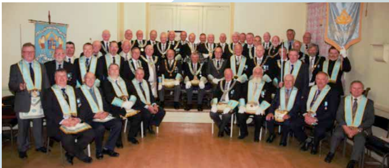
Visiting Dignitaries and Members of Provincial Grand Lodge at our 150th Celebrations in Lodge No. 402 Abbeyleix

The Charity collections taken were very impressive and ritual was well practiced.