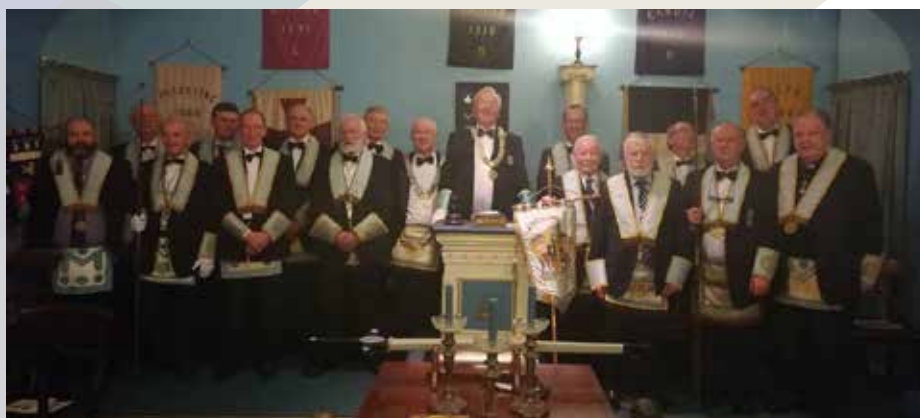
Provincial Grand Lodge Officers