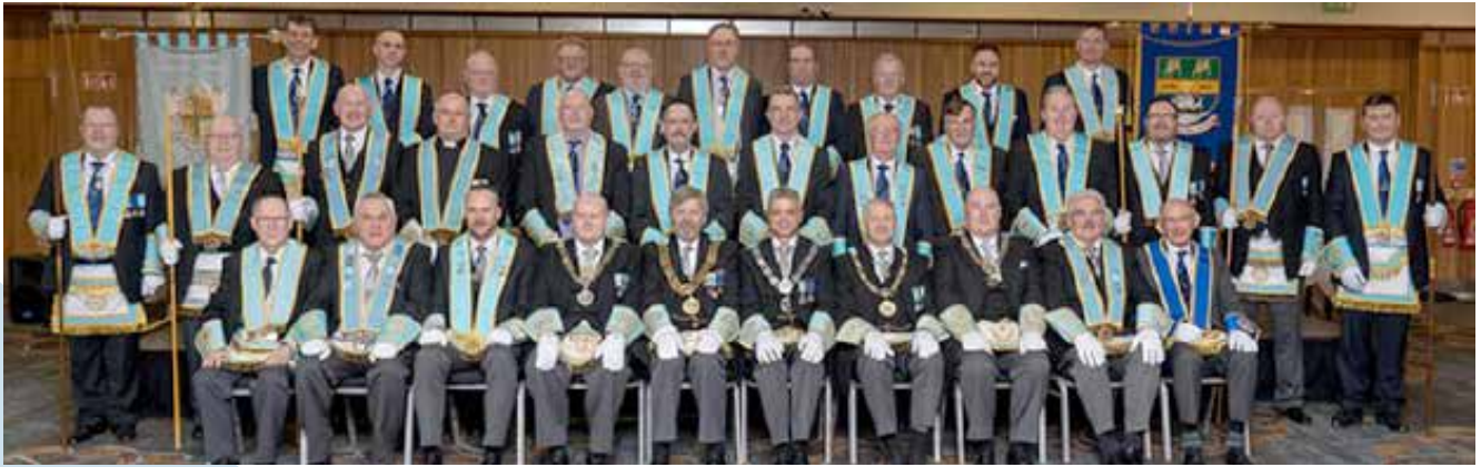
The Officers of the Provincial Grand Lodge of Down. February 2019

a crucial date in the history of the Province. For that evening Brethren from throughout the Province of Down and further afield attended an open meeting, when the Galwally Project Team unveiled their proposals for the 'conversion' of Galwally House into an administrative headquarters for all Masonic bodies, operating within the geographical boundaries of County Down, effectively the Province of Down. The presentation and plans were exceedingly well received, and the project endorsed unanimously by all who were in attendance.