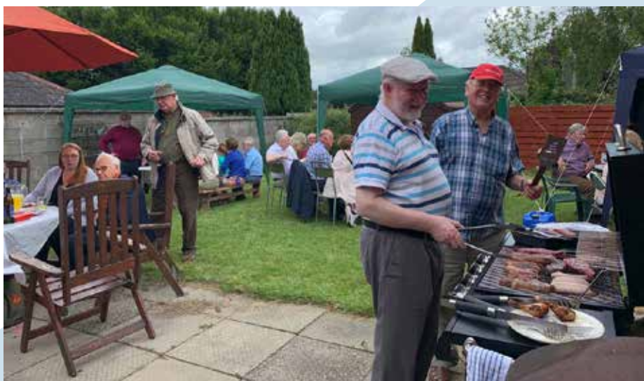
Summer BBQ Clonmel