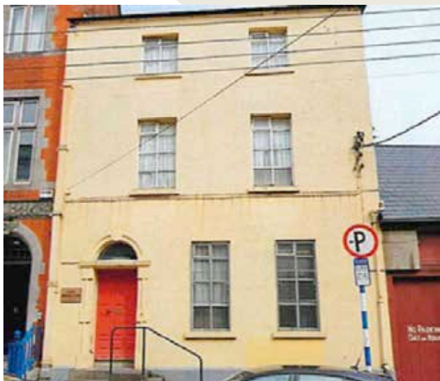
63 Fair Street Drogheda.