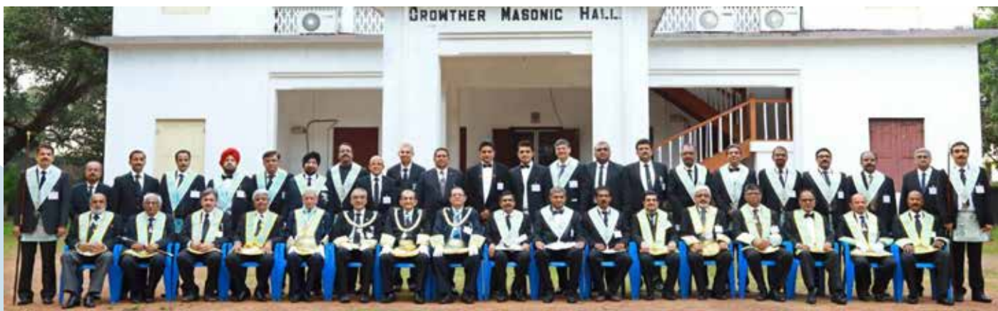
Group Photo on the occasion of the Centenary Meeting of the Minden Lodge no. 464, Kollam at the Crowther Masonic Hall, Kollam. Group Photo on the occasion of the Centenary Meeting of the Minden Lodge No. 464, Kollam at the Crowther Masonic Hall, Kollam.