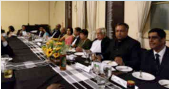
Installation & Banquet 2019 -Sphinx Lodge No. 107

Setukavalar attended the Installation of the Provincial Grand Master of South East Asia on 16th October 2019 in Kuala Lumpur, Malaysia.