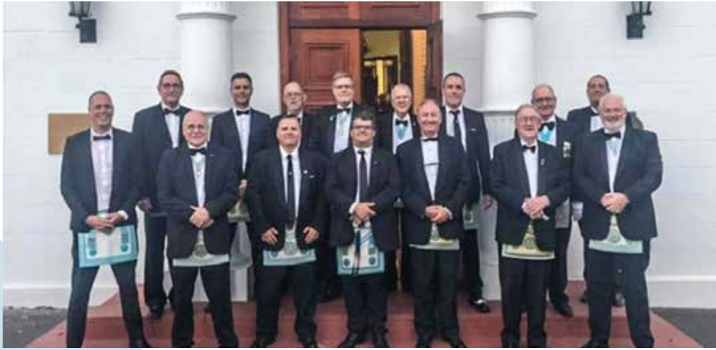
Members of Sharman Crawford Lodge No. 608 at Lodge DE GOEDE HOOP.

donations received from Lodges and Interest earned on Investments. We currently have 2 recipients from