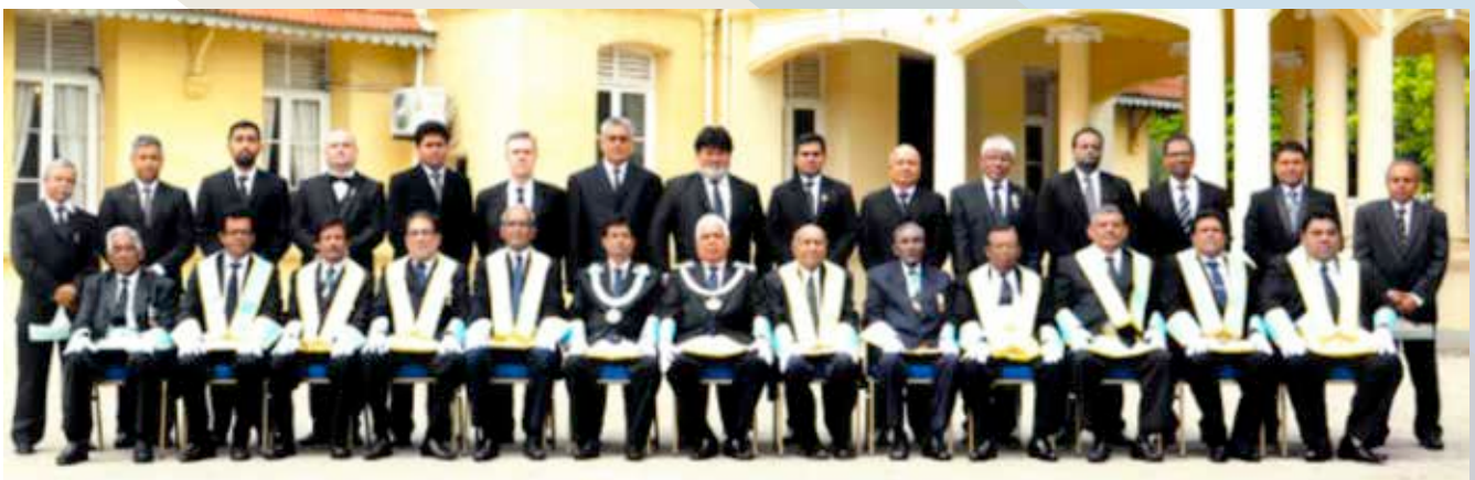
Officers and Members of the Provincial Grand Lodge of Sri Lanka