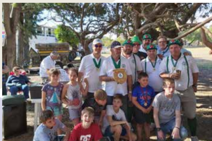
'The Magnificent Irish'