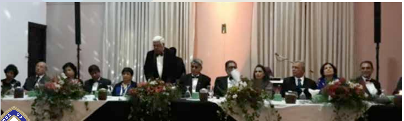
Installation Banquet Dimbula Lodge No. 298