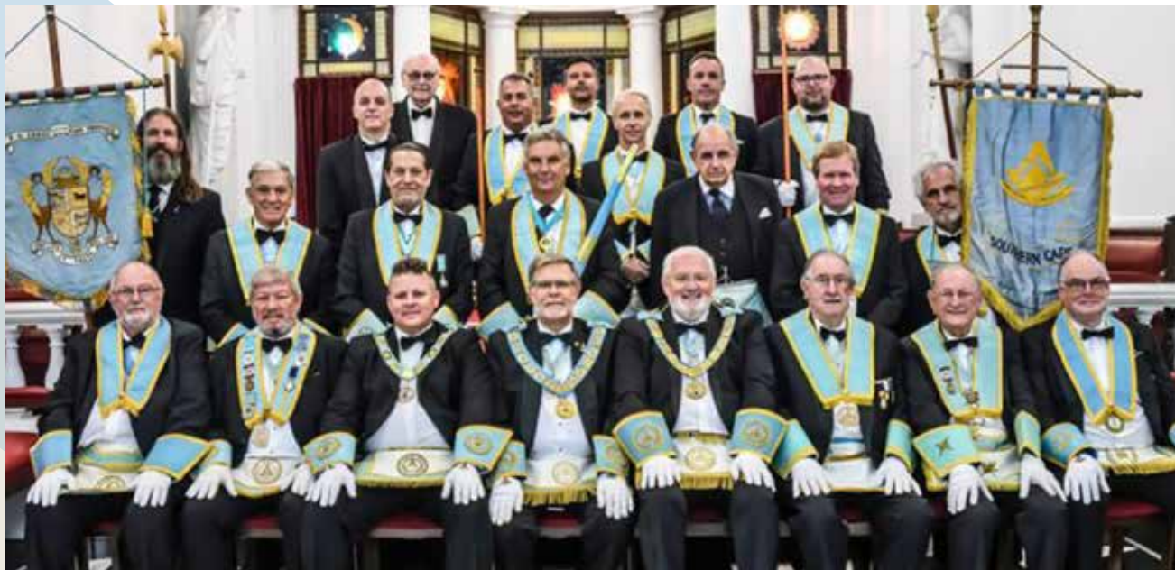
Provincial Grand Lodge Southern Cape Installation February 2019

Eight Installation meetings were carried out within the Province. The support and attendance of Provincial Grand Lodge Officers during the year was again excellent and to these Brethren a word of thanks for their contribution.