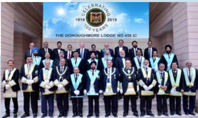
Group Photo on occasion of the Centenary Meeting of the Donoughmore Lodge No. 458.

On the home front, apart from the Centenary celebrations, I attended the Installation Meetings